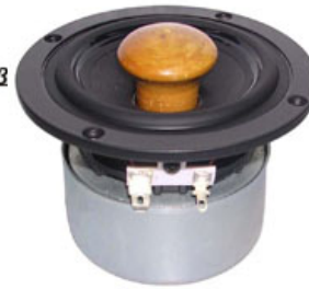
3" PAPER CONE/ FULL RANGE